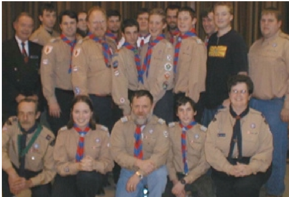
Members and invited guests on Investiture night. Soon after this photo was taken, numbers increased to over twenty.

We will be offering the following services to all Scouting groups. We are available to provide first aid personnel for Beaver/Cub/Scout events. The minimum personnel we would provide to any camp is one first aider and one first responder or paramedic. For larger area camps we would provide several first responders or paramedics and several first aiders. The size of the camp will determine the amount of notice we would require for this service. The minimum notice is one month, due to the working schedules of our people. Ideally the more notice given, the easier it is on